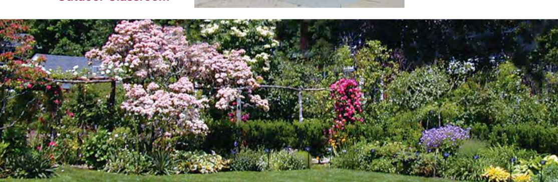
10. / 11. Friends Fountain and Outdoor Classroom

12. / 13. Gathering Lawn and A to Z Garden A meeting place for classes and groups, the lawn is framed with beds of perennials arranged alphabetically by scientific name for educational purposes.